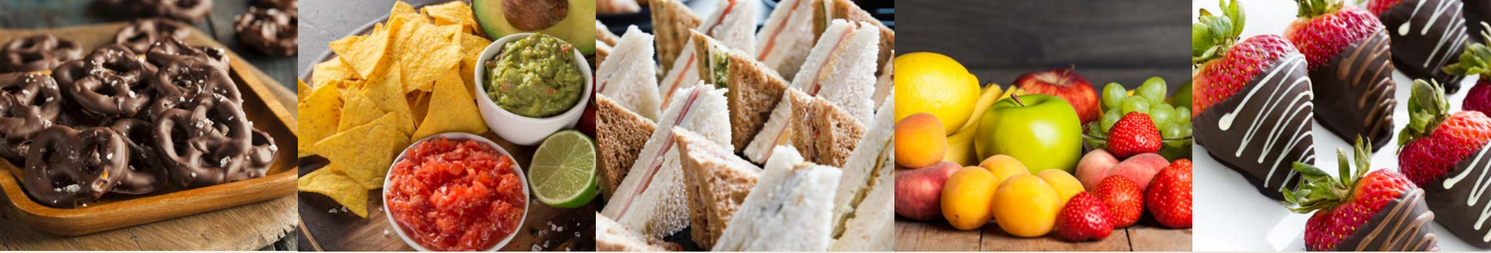
All prices subject to a 21% gratuity and 9% sales tax.